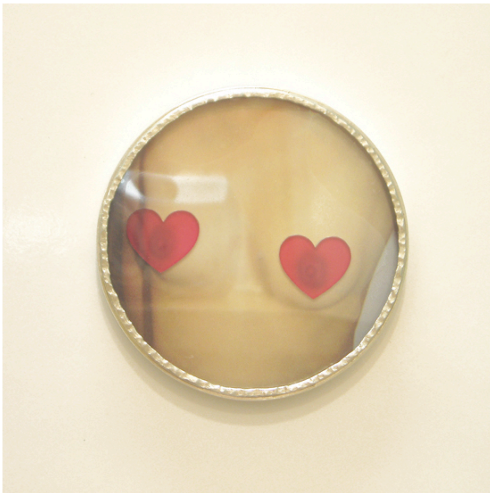
“ mosaic “ 2008 / brooch / silver, photo, plastic

People usually want to show off their jewelry. I was attracted to the showing and the watching.