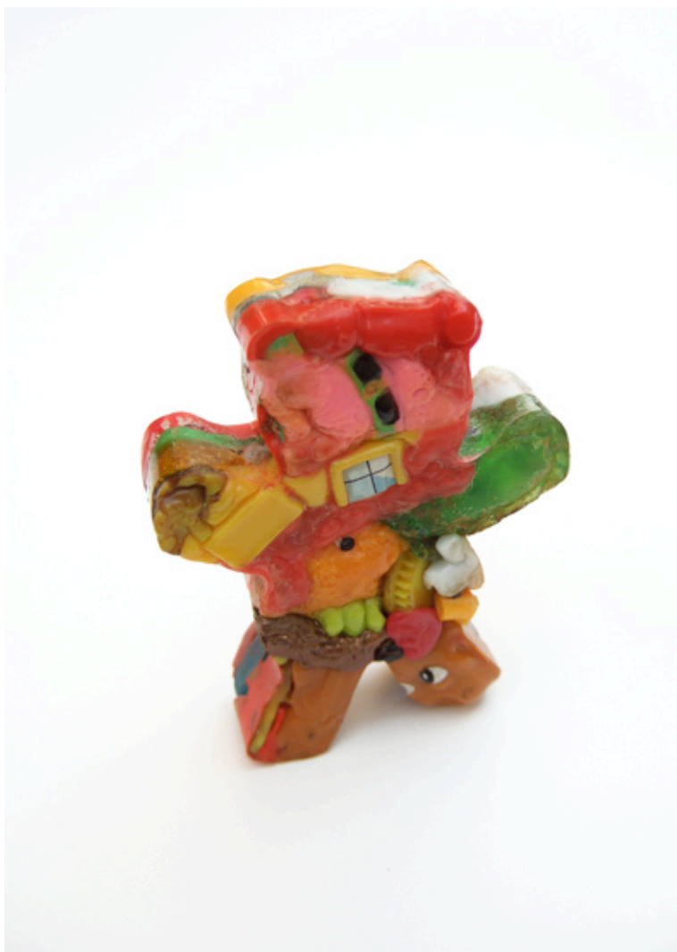
“Brooch study” 2008 / brooch / plastic, steel