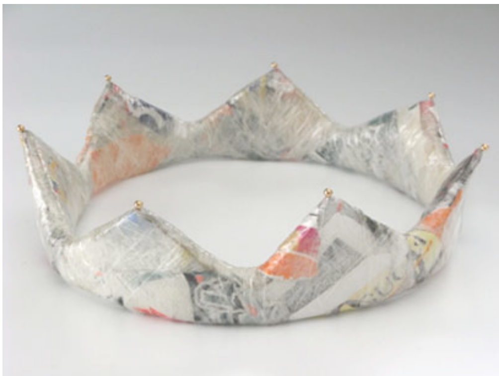
“ Like a king” 2008 / flier, tape, gold750

2007 Transfiguration:Japanese Art Jewelry Today / The National Museum of Modern Art, Tokyo