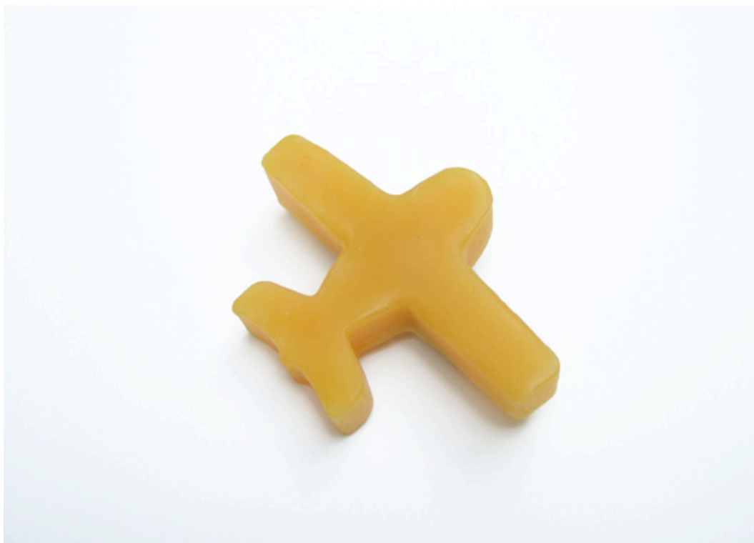
“ Brooch study” 2008 / brooch / beeswax, steel