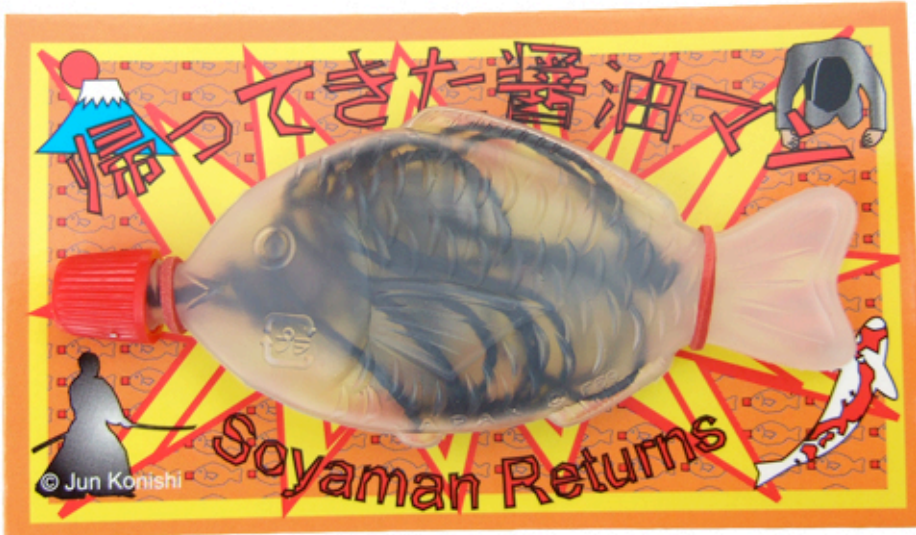
“Soyaman Returns” 2008 / pendant / plastic fish soya bottle, string