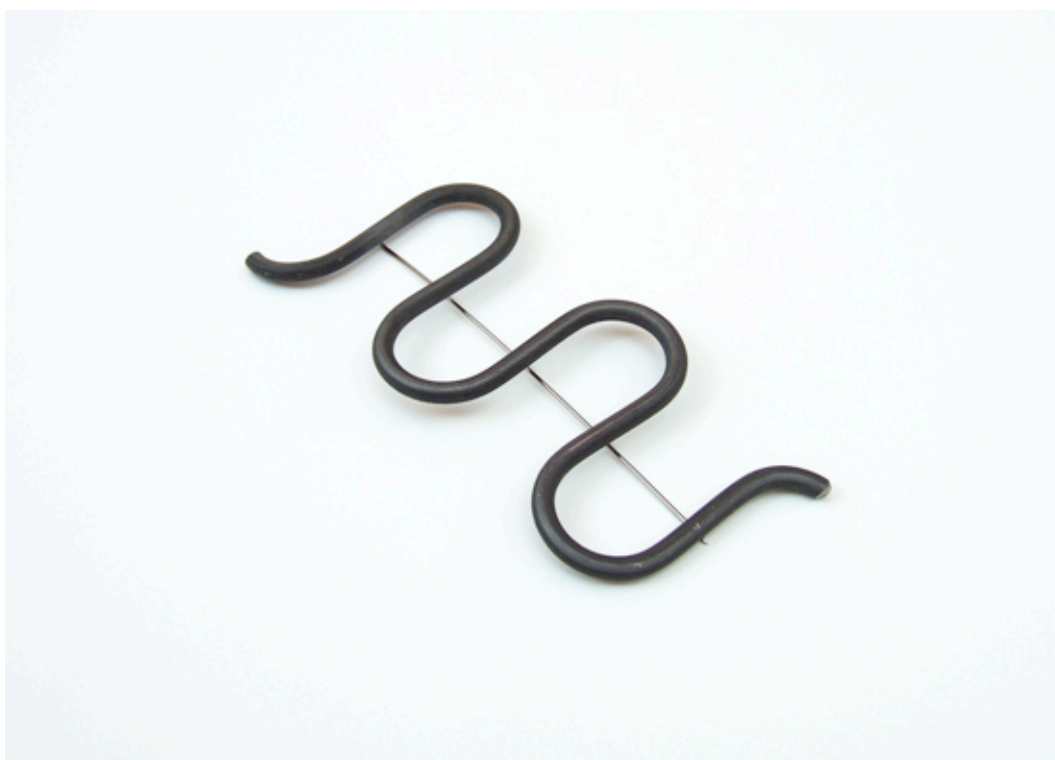
“ Brooch study” 2008 / brooch / spring, steel