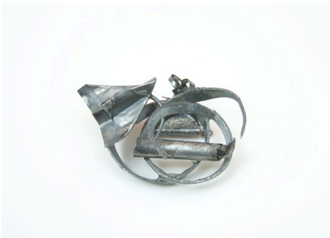
“ Brooch study” 2008 / brooch / zinc, lacquer, steel