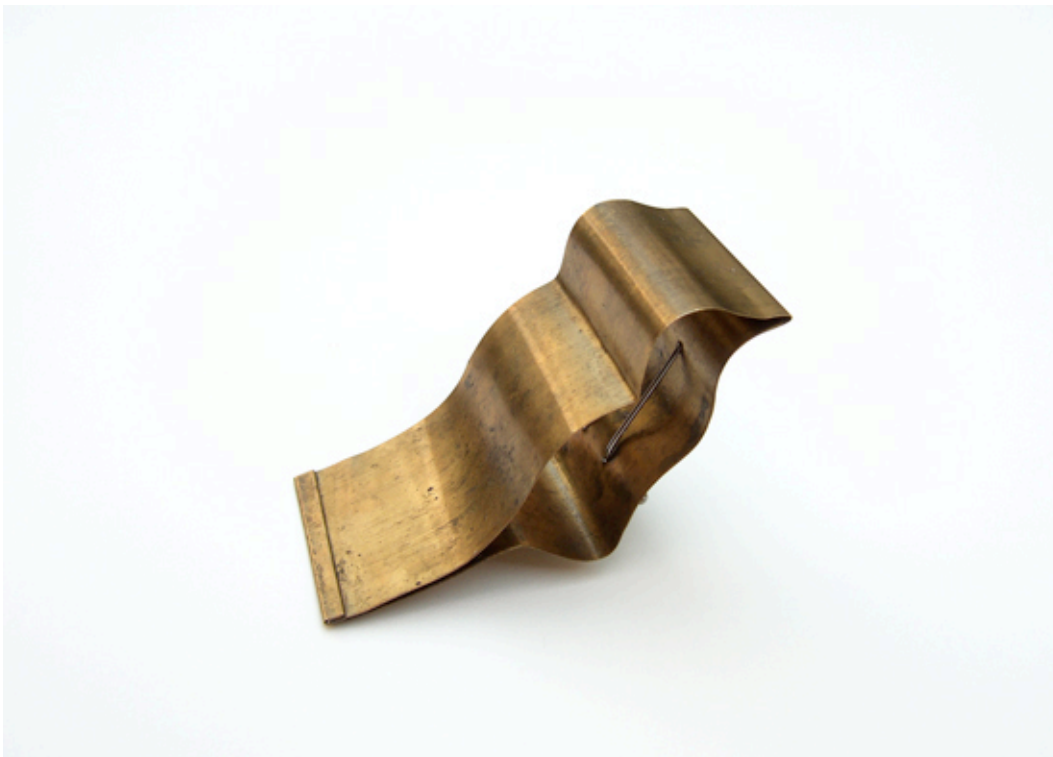
“Brooch study” 2008 / brooch / cookie cutter, steel