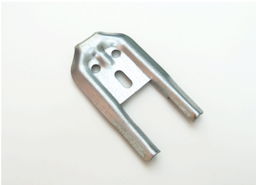
“ Brooch study” 2008 / brooch / steel